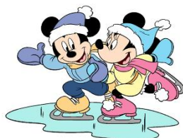
AAFSC Friday Tots

Any questions email us at aafsc@annarborfsc.org